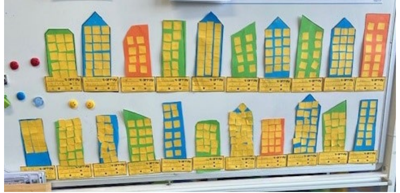
Ashleigh Taplin, Year 2 Teacher

Over the past few weeks, the Year 2 students have been learning to recognise and represent multiplication as repeated addition, groups, and arrays. As part of our learning, we created an array city. This involved organising the windows of our buildings into equal rows and columns to form arrays. We then wrote the multiplication problem and their products beneath the buildings.