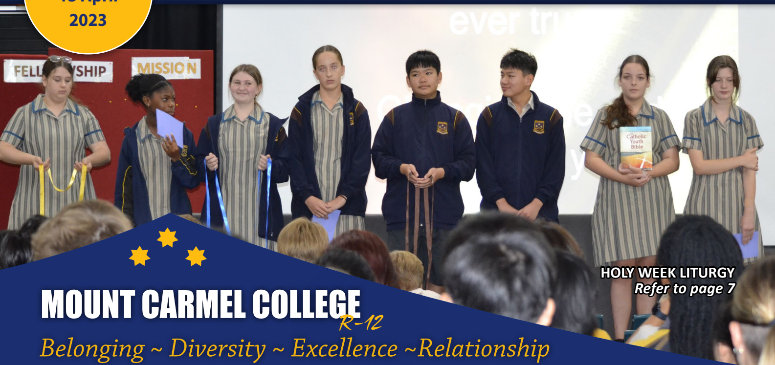
HOLY WEEK LITURGY Refer to page 7