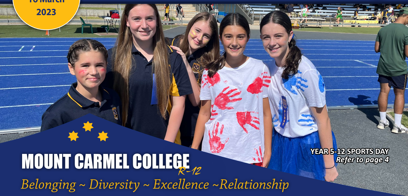
YEAR 5-12 SPORTS DAY Refer to page 4